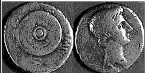
Roman Denarius of Augustus Caesar of the type referred to in the Gospel

T he Pharisees went away to work out between them how to trap Jesus in what he said. And they sent their disciples to him, together with the Herodians, to say, 'Master, we know that you are an honest man and teach the way of God in an honest way, and that you are not afraid of anyone, because a man's rank means nothing to you. Tell us your opinion, then. Is it permissible to pay taxes to Caesar or not?' But Jesus was aware of their malice and replied. 'You hypocrites! Why do you set this trap for me? Let me see the money you pay the